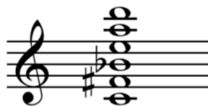
Skryabin's mystical chord

"I consider Skryabin as one of the greatest composers. . . . His music has an unique idealism. . . . The basis of his thinking was an indestructible faith and confidence in Art as a mean to elevate the mind of man and to show light, goodness and truth. Although one cannot say that one can't understand the music without an understanding of his philosophy, one penetrates deeper into his music as one studies what Skryabin inspired. One cannot see the man as a philosopher apart from the composer of such beautiful music."